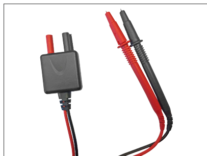
SA163: photovoltaic adapter