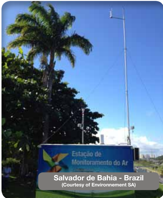
Salvador de Bahia - Brazil