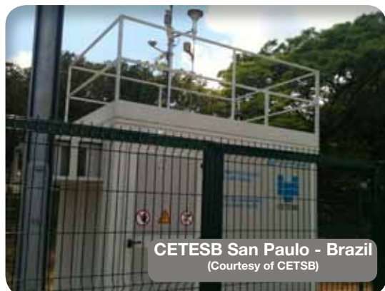
CETESB San Paulo - Brazil