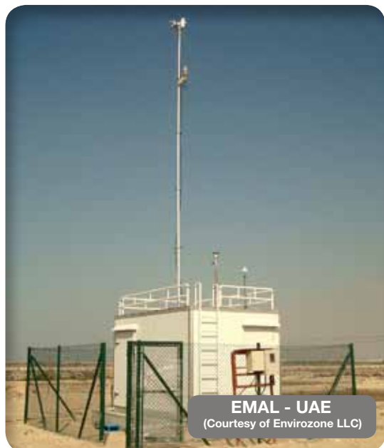
EMAL - UAE