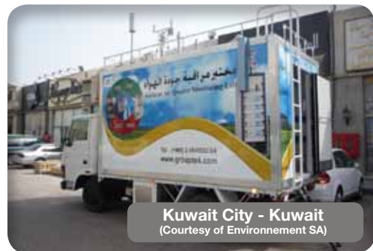
Kuwait City - Kuwait