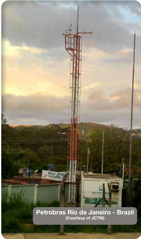
Petrobras Rio de Janeiro - Brazil