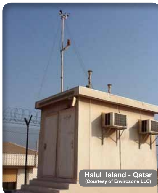
Halul Island - Qatar