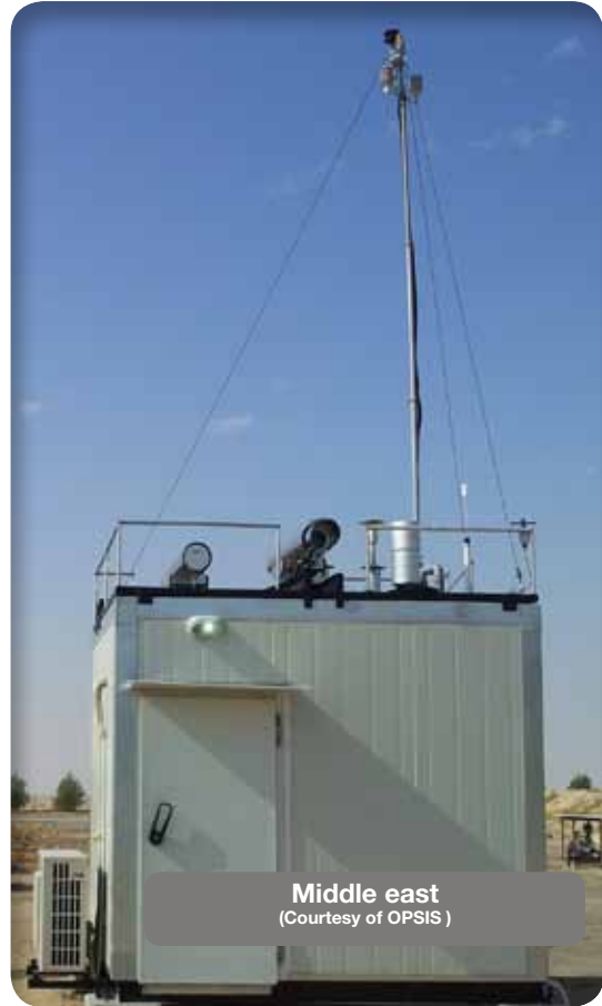
Middle east