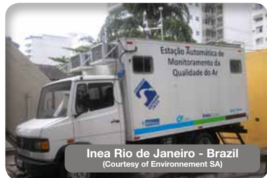
Inea Rio de Janeiro - Brazil