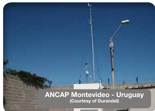
ANCAP Montevideo - Uruguay