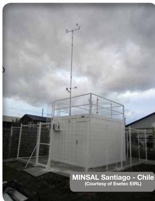
MINSAL Santiago - Chile