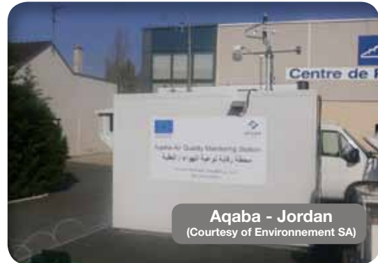
Aqaba - Jordan